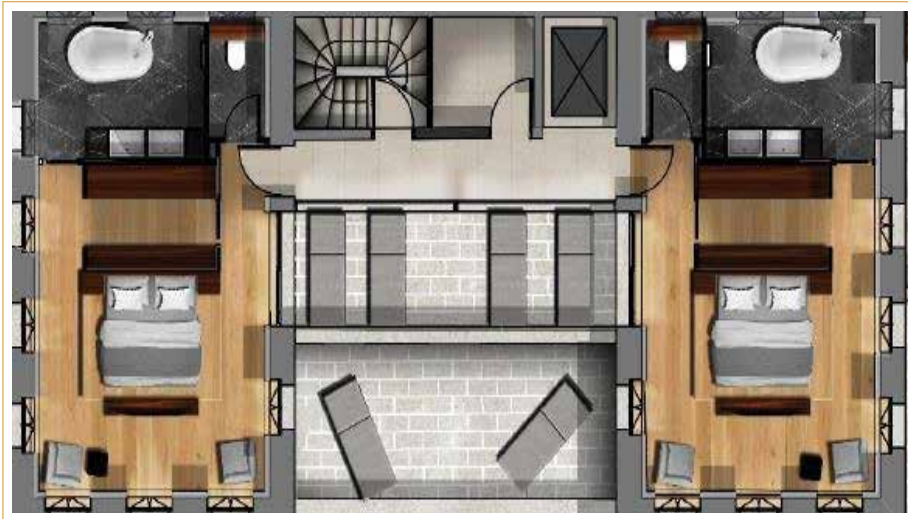
SEPARATE SUITE, GARDEN LEVEL, WELL-BEING AREA